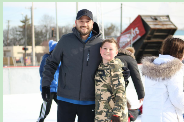
Youth Board of Trustees

In 2024, we launched a youth board , providing high school students from Middletown/Butler Tech, Lakota, Bishop Fenwick, and Middletown Christian with valuable leadership experience. These youth leaders contributed to programming, social media, and event setup/teardown, empowering them to become positive change-makers in their community through mentorship and hands-on involvement.